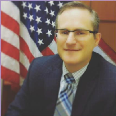
300th District Court Associate Judge